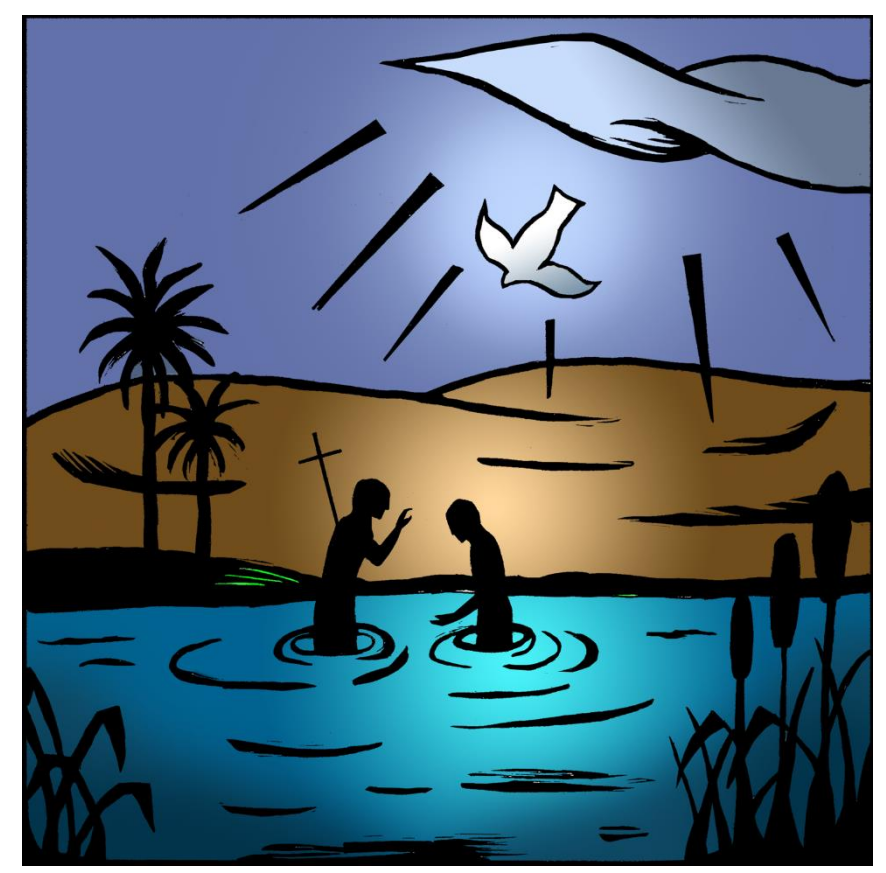
Baptism of Our Lord LBW Setting One without Communion Sunday, January 9, 2022

Advent Lutheran Church 3232 Washington Road Augusta, GA 30907 706-860-0439 www.adventaugusta.org